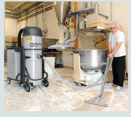
Recovery of flour