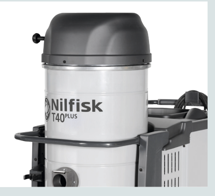
Models in L, M, H class help protect operator's health