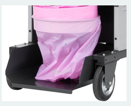
Longopac is available in standard and antistatic version