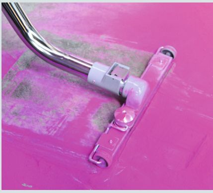
ATEX models for Zone 21,22 and 2 make the working environment a safer place