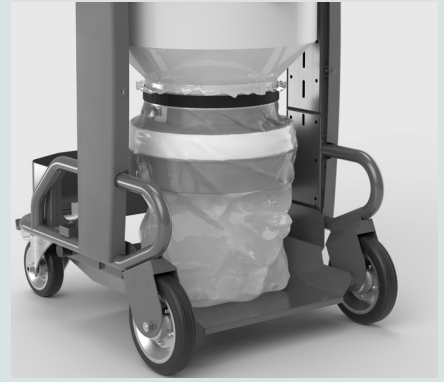
S3 with gravity unload system with Longopac®