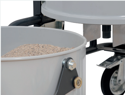
Solid cut-off system