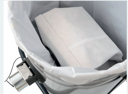
Optional safe bag