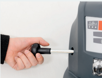
Manual filter shaker