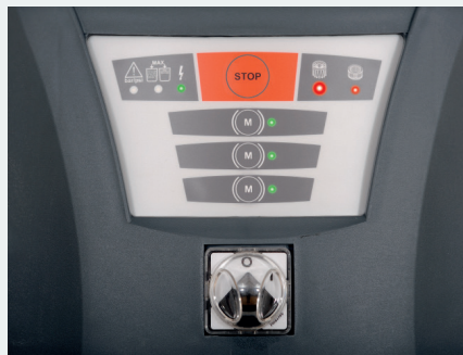
Electronic board control