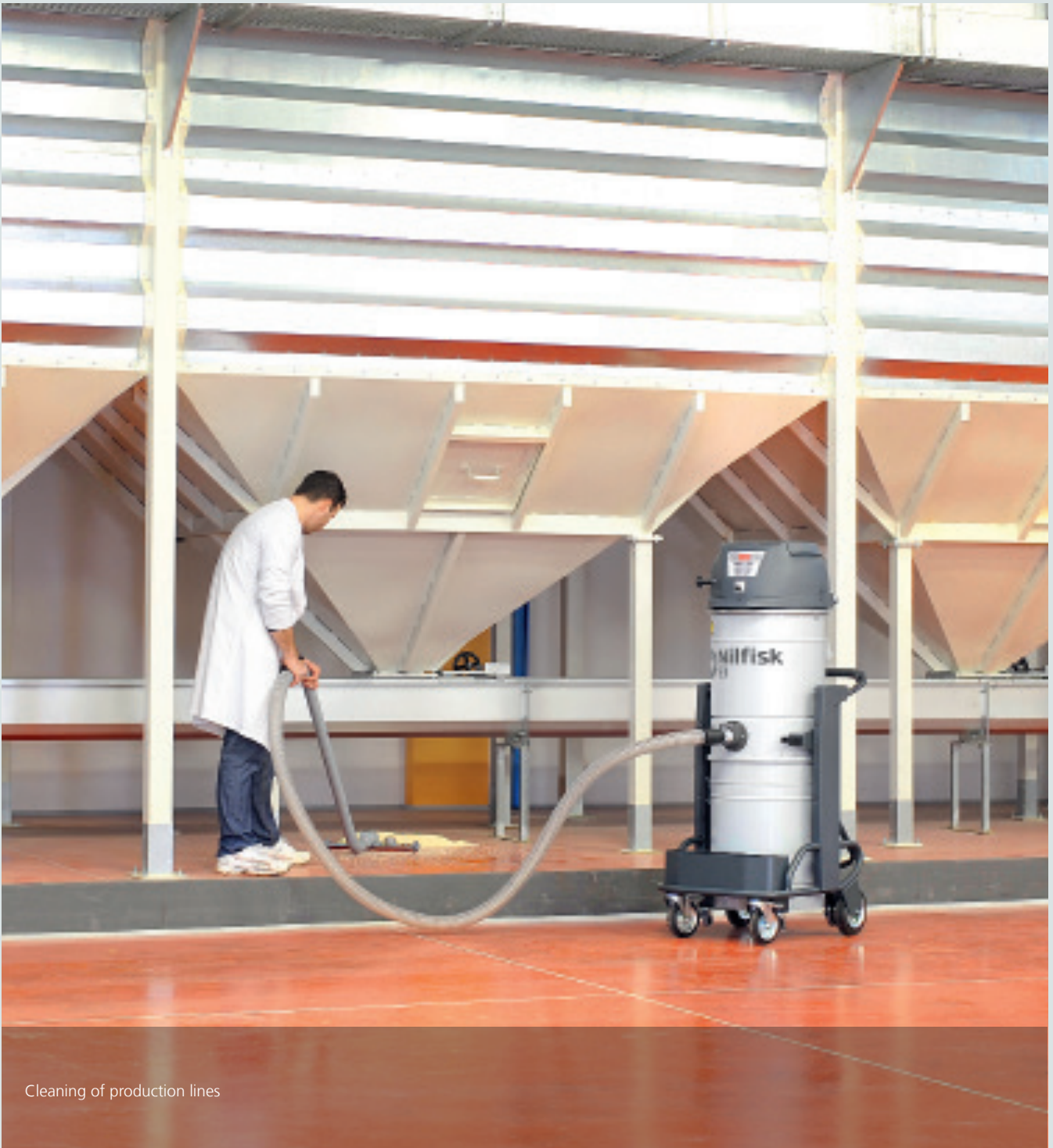
Cleaning of production lines