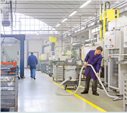
Cleaning of a metal company